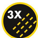
TRIPLE STITCHED SEAMS